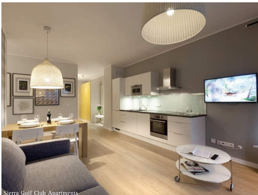
Sierra Golf Club Apartments