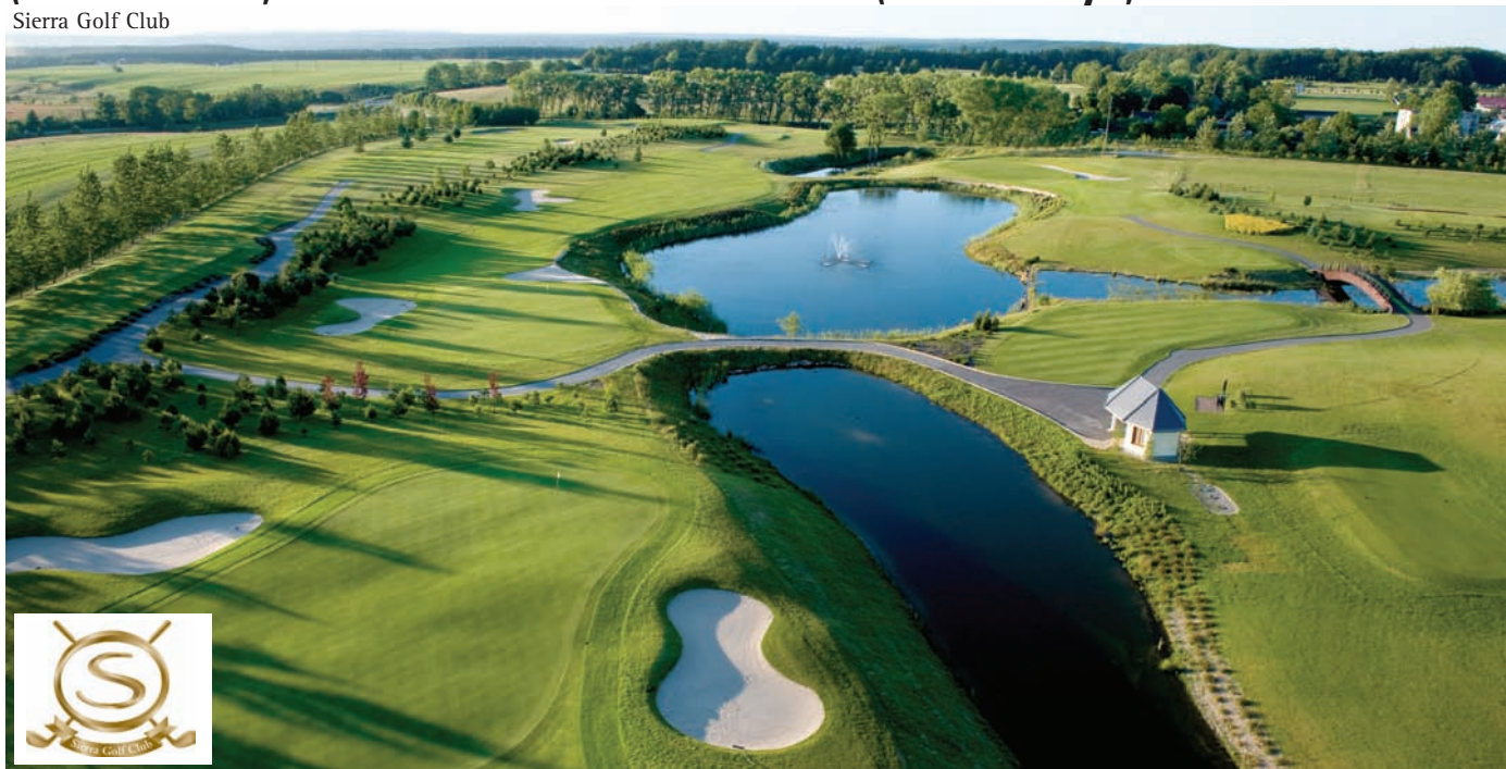
Sierra Golf Club

Irish Golf Review explores a selection of leading golf clubs on the Baltic Coast (near Gdansk) and the Masuria Lake District (near Olsztyn).