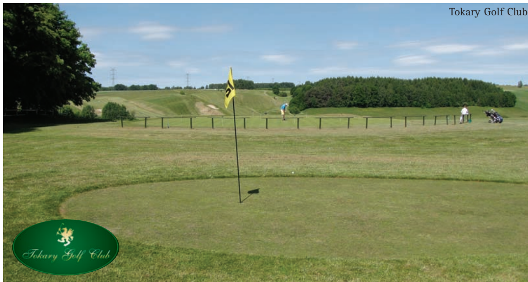
Tokary Golf Club