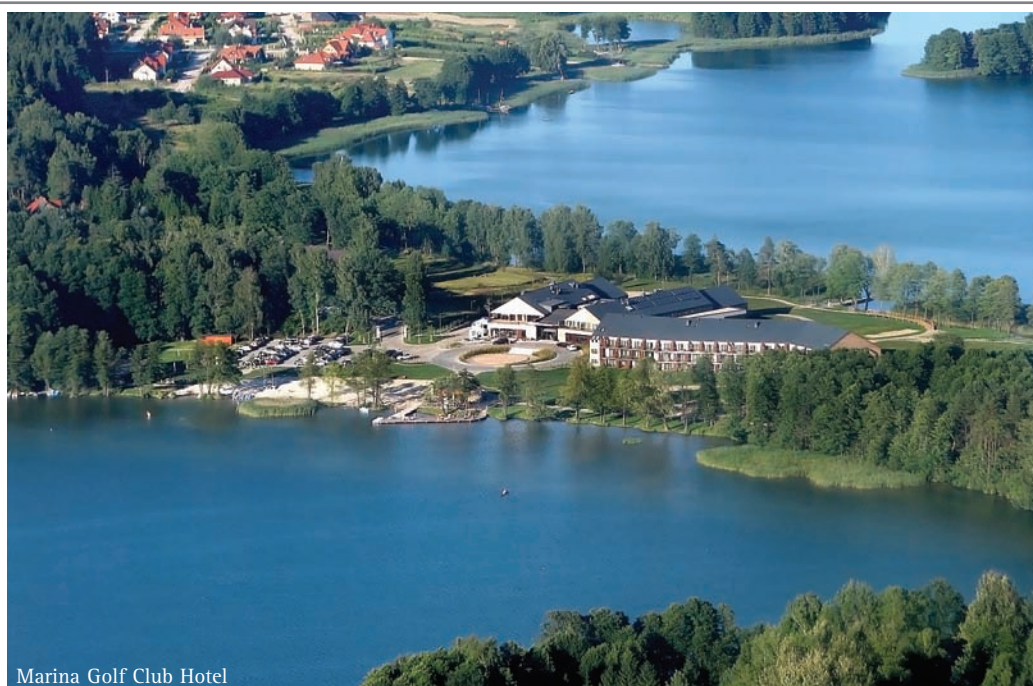
Marina Golf Club Hotel

“The design of the golf course at the Masuria Golf & Country Club was the first undertakings by Hawtree Ltd in this part of Europe. The fundamental aim of the designer was to utilize the extraordinary beauty of the Warmian landscape without causing undue interference to the natural environment”